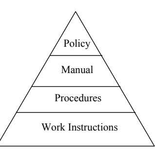
Figure 1: Four Levels

The next level of performance standard is the